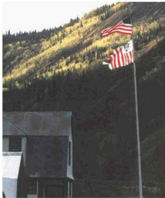
US Civil Flag at the Eagle, Alaska custom-house, on the Yukon River at the Canadian border, circa 1997