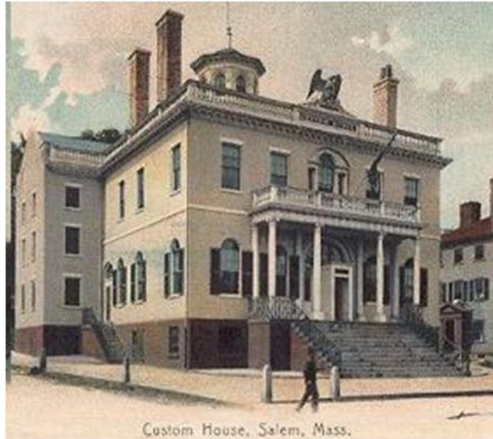
Salem Custom House – circa 1900