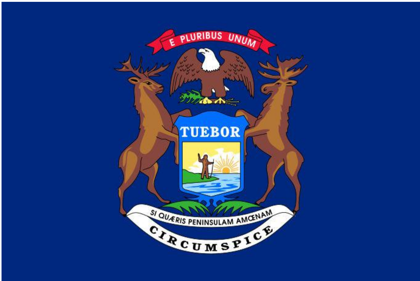
"State flag of Michigan; public domain image on Wikipedia. All State Flags"

Michigan's official flag was adopted by the Legislature in 1911 with a simple description: The State Flag shall be blue charged with the arms of the State (the state coat of arms appears on both sides of the flag, and also on Michigan state seal. Animal symbols: Moose and Elk represent Michigan, the bald eagle signifies the United States Corporation.