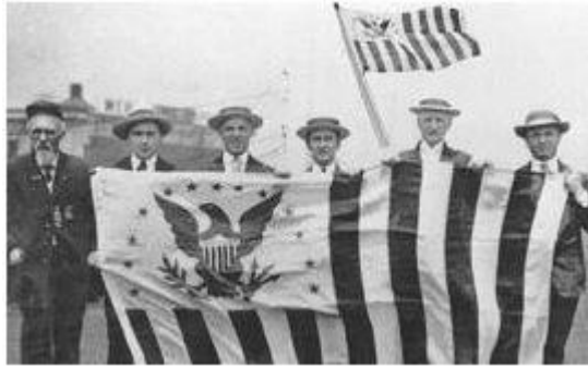
The Flag of Peace US Civil Flags in 1919 at the end of World War I

Such has been the path that has brought us under the Law of the Military Flag. This should have raised serious questions from many citizens long ago, but we've been educated to listen and believe what we are told, not to ask questions, or think for ourselves and search for the truth.