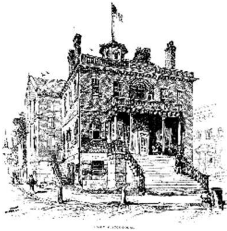
Salem Custom House – 1850

Nathaniel Hawthorne's The Scarlet Letter , published in 1850 before the War Between The States has this description of the U.S. Civil Flag in the introduction, "The Custom House" —